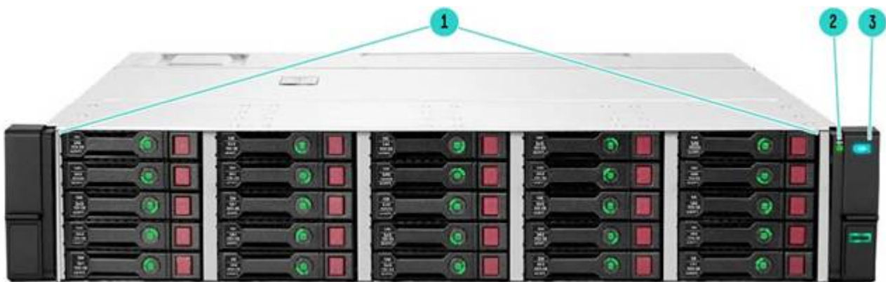
HPE D3710 Enclosure (SFF)

See the Windows Server Catalog for the latest supported configurations. Total support can grow as needed to up to 96 LFF drives or 200 SFF drives.