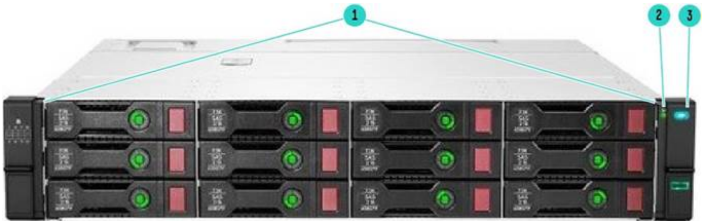
HPE D3610 Enclosure (LFF)